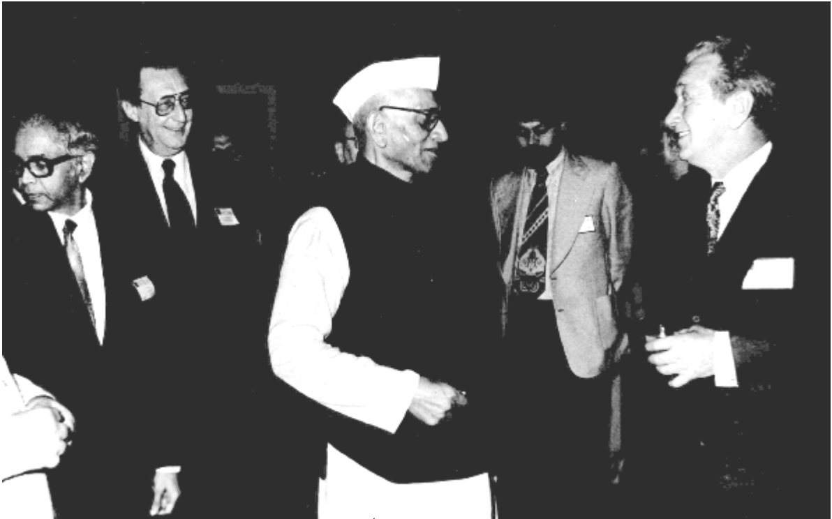
Delegates mixing at the 41 st ISI Session in New Delhi, India, in 1977, with the Honourable Mr. Morarji Desai (centre of the photograph).

Did you know the Indian Government issued a special commemorative stamp to celebrate the New Delhi Session? Should any of you know of its whereabouts, please share it with all of us.