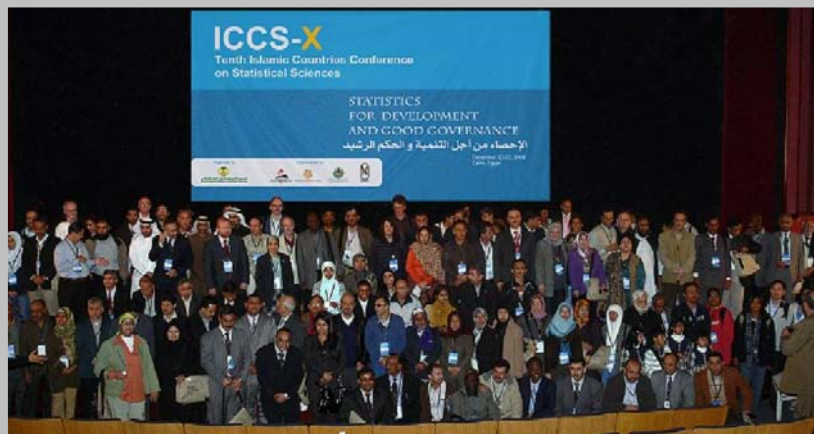
ICCS-X participants in a scientific session

Relating to the history of the invention of paper from the papyrus and the collection of essence from the lotus were popular items of purchase. Many went to the Egyptian Museum to see the mummies of the Pharaohs, including Ramses II, many consider to be the Pharaoh of Moses. The rich and colorful history of the ancient Egypt includes the first ever census conducted by Moses to count the men of Egypt at the time.