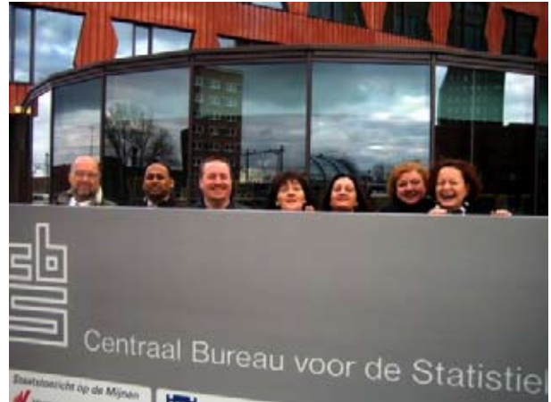
ISI Permanent Office staff can barely be seen from behind the new nameplate.